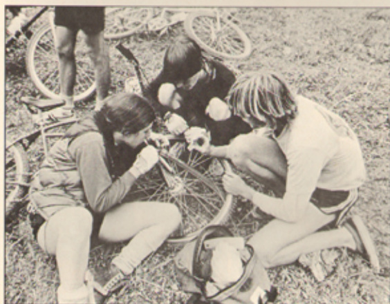
Although infrequent, flats will obviously occur, so a patch kit is absolutely necessary, and a spare tube can be handy. On this trip, six bikers got flats after riding over the same exposed nail on a horseshoe.

two-day trek is to reach the 12,700-foot summit at Pearl Pass, but the fun, camaraderie and breathtaking scenery steals the show. The first day's ride to the campsite at 11,000 feet covers 18 miles while climbing about 2,000 feet. It is ridden at a leisurely pace with plenty of time to absorb the fall colors of the changing Aspen trees. Once in camp, riders set up tents before enjoying the four legs of beer cooking in a nearby stream.