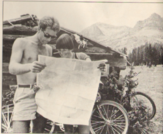
Group expeditions on mountain bikes are becoming more popular as riders learn the advantages of off-road touring. Having your map skills is important, especially if you explore new territory off the beaten path.